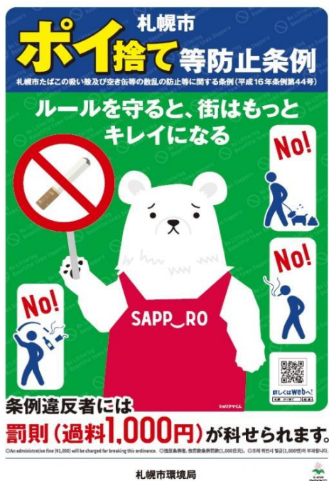
Fig. 3: City of Sapporo anti-litter campaign, 2019;

via a cute mascot. Text orientation is horizontally, from left to right, different from the traditional norms, vertically, from right to left. Colors have an important role in advertisements and in this case it creates connections between signs. In figure 2 the dark shades used and the puddles suggest an apocalyptic scene, an irreversible process, a warning message that is meant to scare the viewer. On the other hand, in figure 3 the mascot, a fictional white bear with a sad expression is anthropomorphized and plays the role of the “model citizen”. The vivid colors used help in creating and sending a positive vibe to the receiver by appealing to emotions and compassion. The headline is emphasized in yellow characters, Poi sute 「ポイ捨て」 meaning “Littering” followed by further explanations: nado bōshi jyōrei 「等防止条例」 “and other prevention regulations”. Delimited by a different color, a vivid green symbolizing nature and green zones the next section of the poster is concentrated in exposing morally bad or wrong behaviors. The motto is represented with white characters and states: Rūru o mamoru to, machi wa motto kirei ni