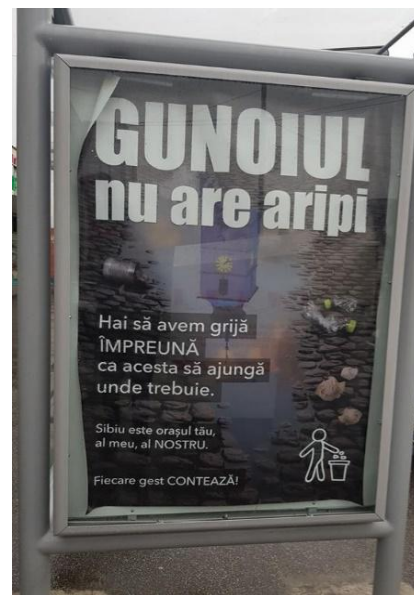
Fig. 2: Sibiu Town Hall campaign, 2017;

In the same manner, figure 3 is an example of a Japanese print advertisement from an anti-litter campaigns to raise awareness. The difference between the two advertisements is visible from the start in terms of visual signs, at least. This poster is part of a 2019 campaign started at the initiative of Sapporo City Hall. Even though the two posters were created for the same purpose the constituent signs differ considerably and this can be explained from world view which is strongly related to culture and traditions. In this sense, advertisements can be perceived as a reflection of a specific culture and society in a specific timeframe. As opposed to Romanian public, non-commercial advertisements Japanese ones have the tendency to