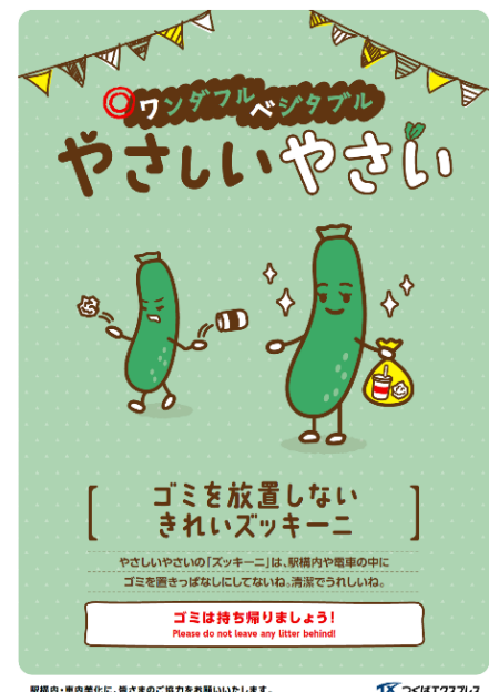
Fig. 3: Tsukuba Express, Yasashii yasai series, February 2019;

The poster in figure 5 is an example that shows the capacity of an advertisements to generate connections between a general desirable behavior and emotions, thus in this case through the anthropomorphism of a zucchini and other visual signs the receiver is persuaded by appeals to irrational, imagination, fantasy. The construction wandafuru bejitaburu (“Wonderful vegetables”) 「ワンダフルベジタブル」 position in the upper-most part of the poster, along words like yasashii (“kind”) and kirei (“nice”, “clean”) have the capacity to convey good vibes and to create a relaxing atmosphere while connecting these treaties to the act of keeping the train clean. Overall these constructions can be interpreted in a humorous note due to the association with vegetables, in this case zucchinis. The posture of the personified zucchinis is on one hand an index of anger and disregard towards the rules and on the other one of obedience and tranquility of a model citizen meeting society’s expectations. The construction isolated through square brackets: Gomi o hōchi shinai kirei zukkinii (“Nice zucchinis do not litter”) is a statement of the fusion, the interferences between real and surreal and it creates a link between a real occurrence and fantasy. The idea is exploited further in small print: Yasashii yasai no “Zucchini” wa, ekikōnai ya shanai no naka ni gomi wo okippanashi ni shitenai ne. Seiketsu de ureshii ne. (“Nice