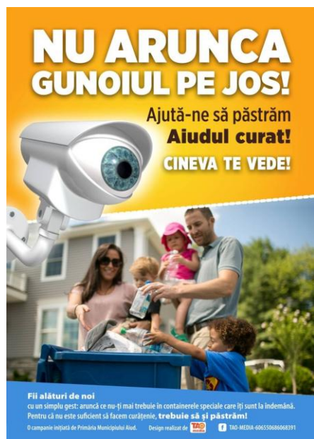
Fig. 4: City of Aiud anti-littering campaign, 2017;

The poster represented in figure 4 is another example of Romanian public service advertisement considering littering and its impact on the environment. It is part of a 2017 anti-littering campaign conducted in Aiud, a small city in Alba County at the request of the City Council. The message is constructed around the idea of fear and consequences by invoking 24/7 surveillance through the representation of a camera in an unrealistic size and an almighty Eye watching over, an index for spying like Orwell's Big Brother. The headline is written in capital white letters, "NU ARUNCA GUNOIUL PE JOS!" ("Do not litter!") and this negative construction is backed-up by the message "CINEVA TE VEDE!" ("Someone is watching!"), thus it creates a clear link between bad conduct and possible repercussions.